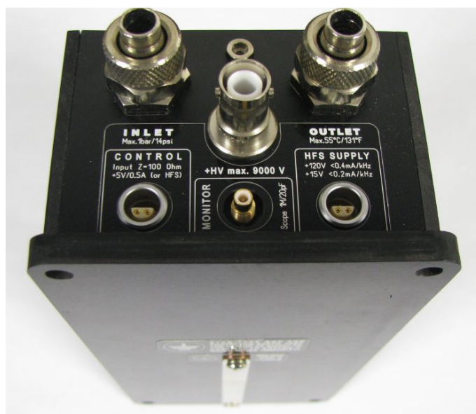
Figure 2: Front control, high-voltage, and coolant connections.

The FSWP pulser does not contain an internal high-voltage source. An external high-voltage power supply is needed, the polarity of which matches that of the pulser. The high voltage input to the FSWP pulser is via a SHV coaxial connector located on the front panel. The mating plug is included with the pulser. Regarding the choice of coax cable, there are a lot of inferior-quality coax available that are not suitable for high voltage operation. Use only cables that have a “solid PE” insulation. RG-59/BU has a slightly higher insulation thickness which will add to the voltage ratings over RG-58 however another option would be to choose a manufacturer of specialty high voltage cable such as Teledyne Reynolds part number 167-9785 which is dimensionally similar to RG-58 and RG-59 but has a voltage standoff rating of 40kV.