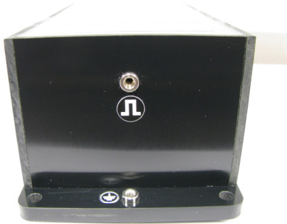
Figure 3: High-Voltage Output Connections

The high-voltage output connections are via M3 threaded bosses located on the rear of the pulser.