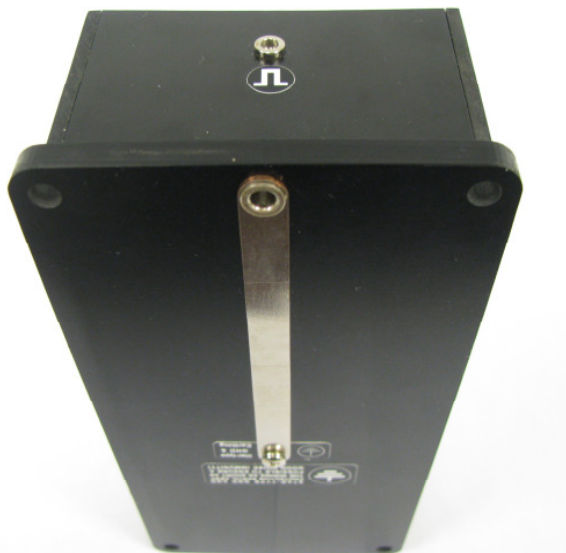
Figure 4: Grounding Bar Location and Connection

The actual ground output is on the bottom of the pulser. A grounding bar, provided with the unit, brings this connection out to the rear of the pulser. Note that this grounding bar is removable and that the unit will not mount on a flat surface with it in place however if the grounding bar is removed, the HV ground output cannot remain unconnected.